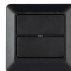
Wireless Wall Station